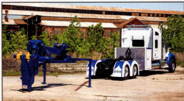
Some optional equipment shown.